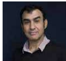
Abderrazak El Albani